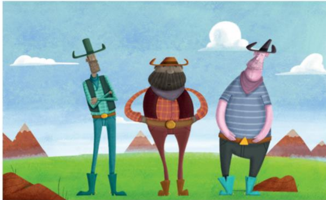
A group of cowboys

Cowboys were needed to move the cattle from one place to another. This could take months, so the cowboys lived and worked together and became friends.