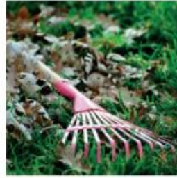
Raking up leaves