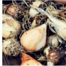
Bulbs ready for planting