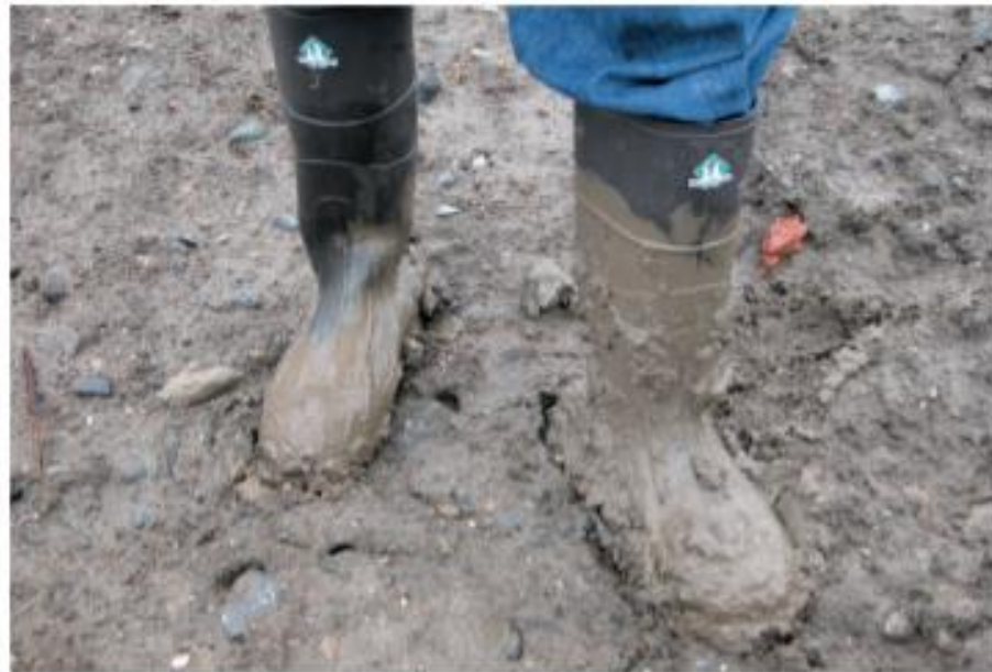
It can be dirty work.

Another problem is that it can be dirty work. It's easy to get cuts and scratches from the roses and other plants, and there are itchy insect bites to worry about in the summer.